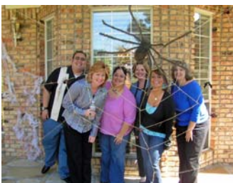
CASA/ DFPS Meet and Greet October 2008